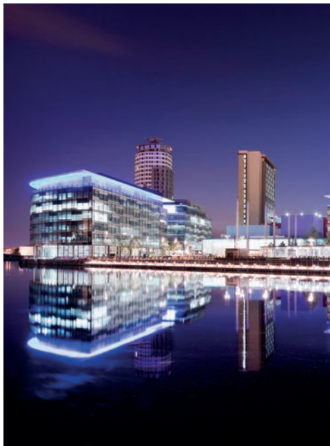
Holiday Inn tower, MediaCityUK, Manchester

These five projects were originally part of the Target Zero study conducted by a consortium of organisations including Tata Steel, Aecom, SCI, Cyril Sweett and the BCSA in 2010 to provide guidance on the design and construction of sustainable, low- and zero-carbon buildings in the UK. The cost models for these five projects have been reviewed and updated as part of the Costing Steelwork series. The latest cost models as of Q2 2019 are presented here.