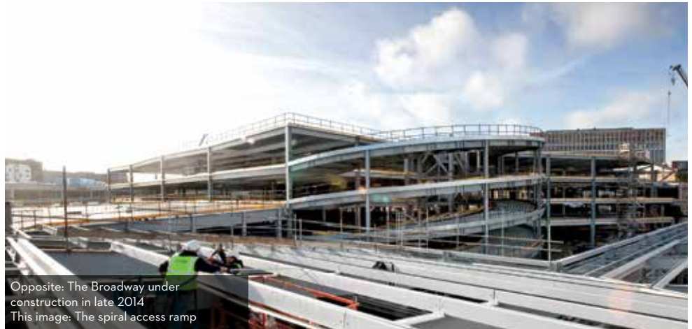
Opposite: The Broadway under construction in late 2014 This image: The spiral access ramp

The car park has one of the most innovative features of the steelwork design; a spiral access ramp, which was changed from concrete in the