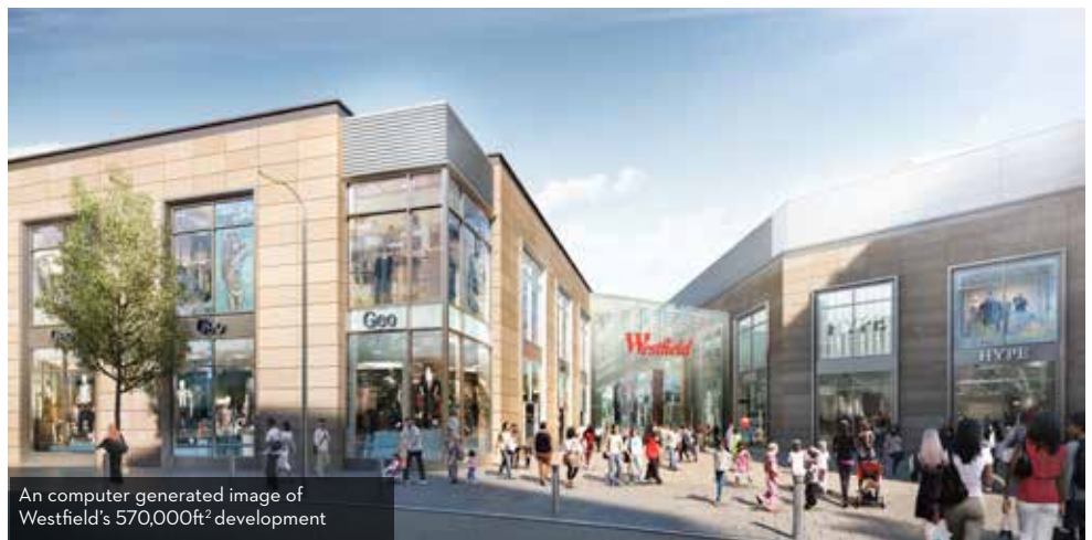
An computer generated image of Westfield's 570,000ft² development

H&M WANTED TO CREATE A 'POP UP' LEVEL IN THE ROOF, ABOVE THE STORE, WHICH MEANT EXTRA STRUCTURAL STEEL HAD TO BE ADDED. THIS IS WHERE STEEL'S FLEXIBILITY COMES TO THE FORE