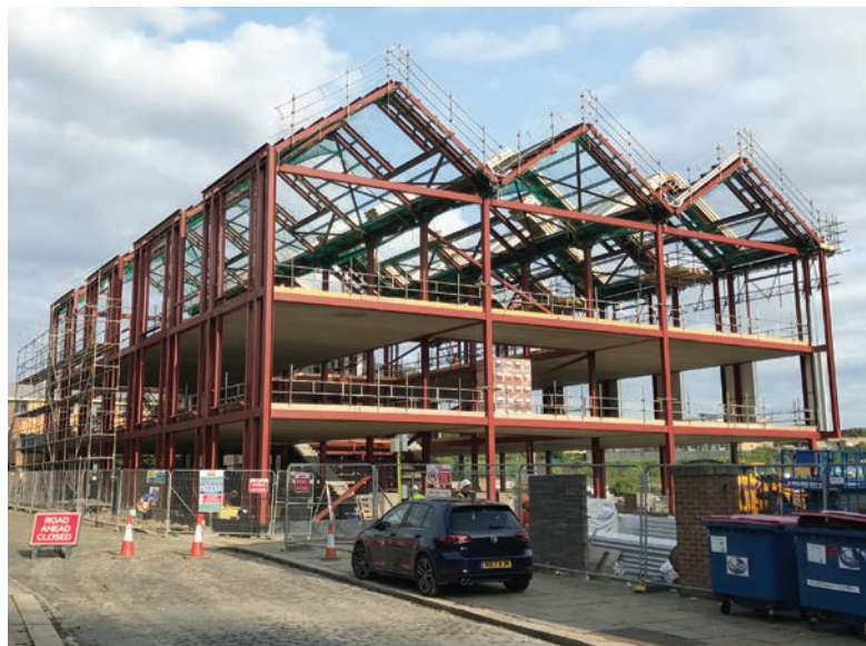
The steel frame is braced for stability and incorporates moment frames

Award: Tombola HQ, Sunderland Architect: Ryder Architecture Structural engineer: s h e d Main contractor: Brims Construction Client: Tombola