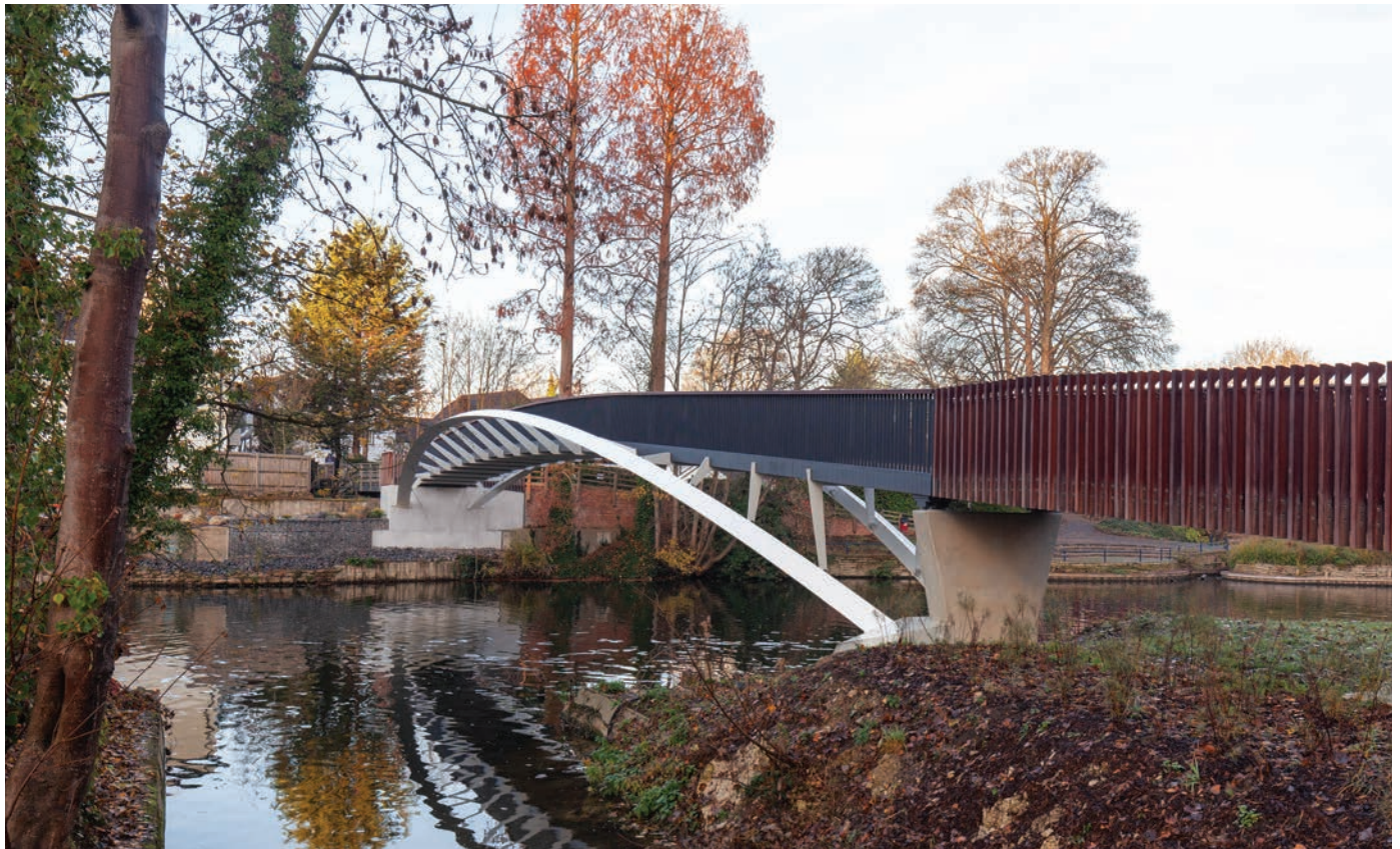
TAPLOW PHOTOS: ©ANTHONY PREVOST; CHISWICK PARK: ©JILL TATE

The steel structure was designed with structural efficiency in mind but